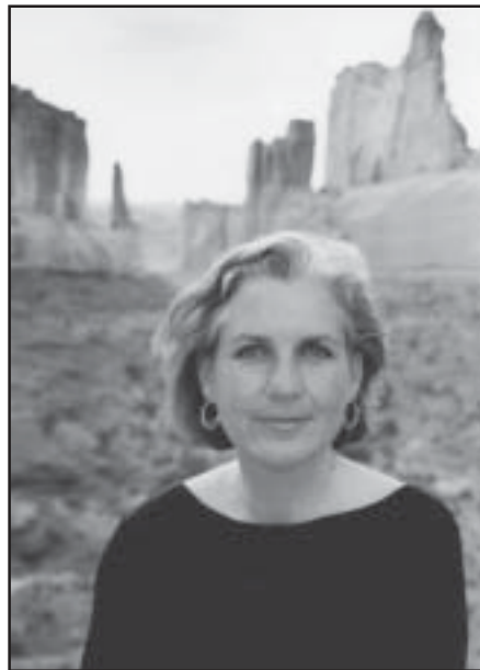
Author Terry Tempest Williams

Williams is perhaps best known for her book Refuge: An Unnatural History of Family and Place (Pantheon, 1991), in which she chronicles the epic rise of Great Salt Lake and the flood of the Bear River Migratory Bird Refuge in 1983, alongside her mother's diagnosis with ovarian cancer, believed to be caused by radioactive fallout from nuclear tests in the Nevada desert in the 1950s and 1960s. The book is now regarded as a classic in American nature writing. The San Francisco Chronicle wrote: "There has never been a book like Refuge ... utterly original." The Kansas City Star called it: "Profoundly